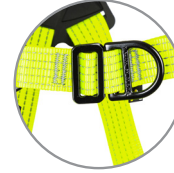
Front attachment point