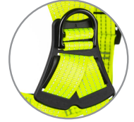
Rear attachment point