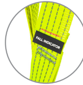
Rip stitch indicators