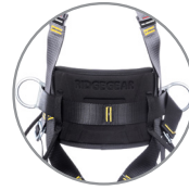
Work positioning belt