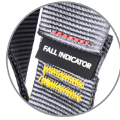
Rip stitch indicators