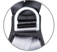
Rear attachment point