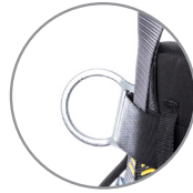
Fold back D rings