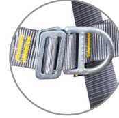
Front attachment point