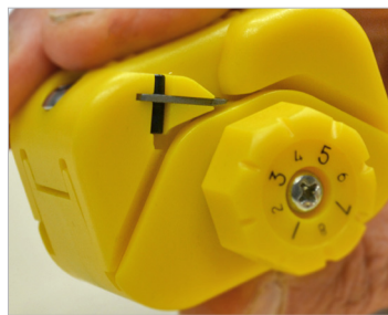
Spring-loaded design eliminates need to lock or clamp tool while in use.