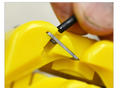
Fixed stainless steel blades require no adjustments and replace easily.

For more information or to locate the nearest authorized Ripley® distributor, please visit www.ripley-tools.com or call 1 (800) 528-8665 to speak to a customer service representative.