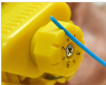
Built-in sizing channels determine proper setting for loose tube cables.